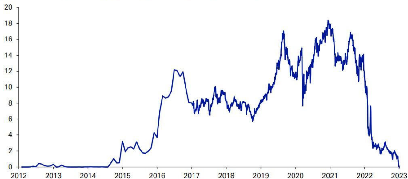
Figure 1: Bloomberg Global Aggregate Negative Yielding Debt (USD trillions) – The end of an era...